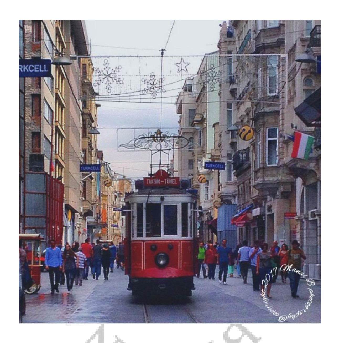
Iyi Yolculuklar! Have a good journey!